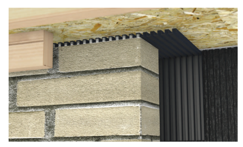
Floor Edging can be used in brick & stone soffit details to vent the rainscreen air gap

4' sections of Floor Edging are easy to install in new & renovated basements