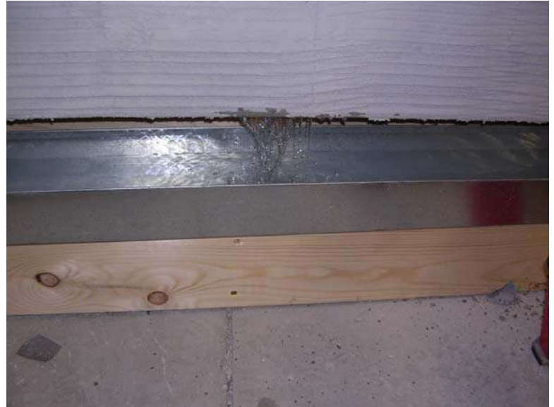
Typical flow from panels B through E