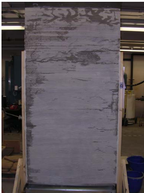
Panel A face