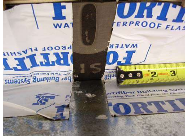
Gap left in funnel after membrane installation