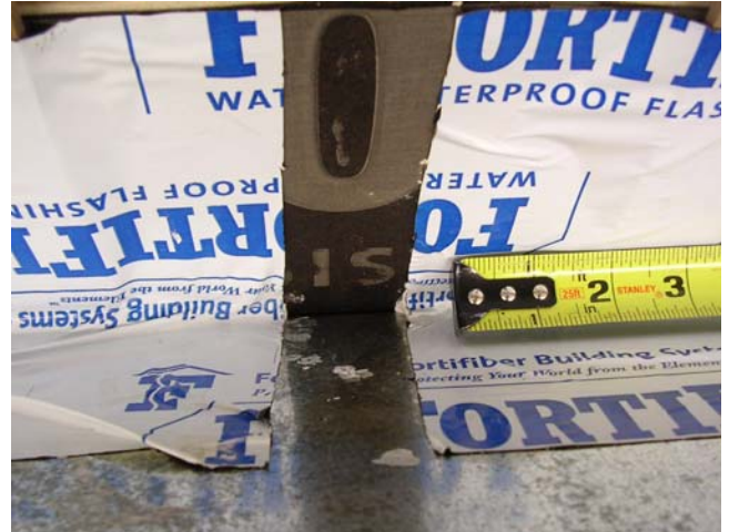
Gap left in funnel after membrane installation