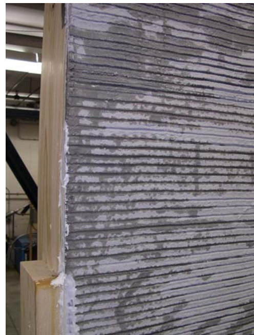
Panel A Edge