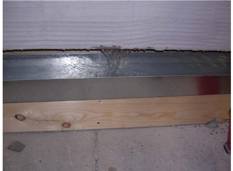
Typical flow from panels B through E